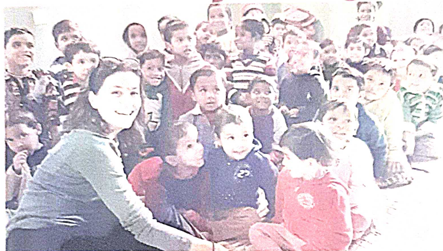
Eva Longoria at the NGO for kids in Gurgaon